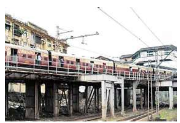
Fig: Elevated Rail Corridor

The greater part of bridge structures are being developed utilizing pre-thrown sections introduced utilizing the under threw brace procedure. The benefit of this strategy is that it empowers the viaduct deck interruption to traffic underneath.